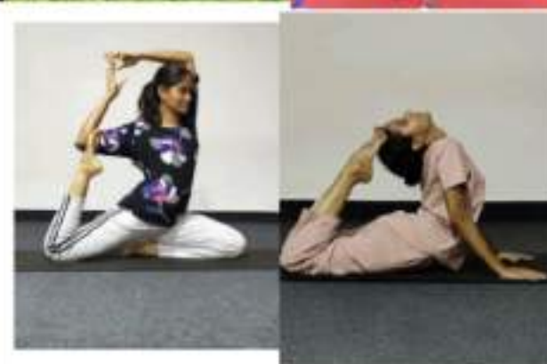
Eka Pada Raja Kapotasana