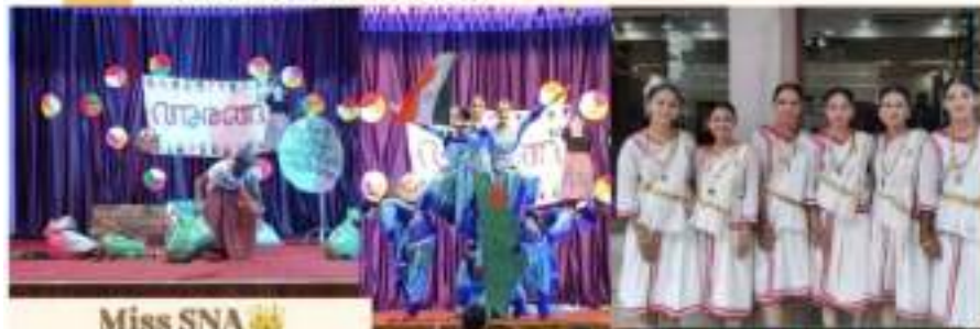
Miss SNA 🏆

ARANGU 2025 stood as a true celebration of talent and unity—bringing together hearts, voices, and stories that reflect the spirit of Amala's nursing community.